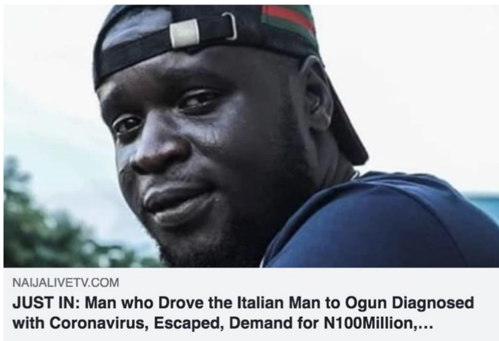
Figure D3. False 2.