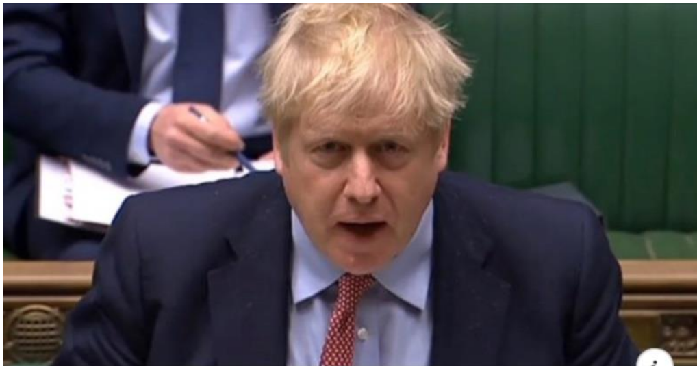
Figure D6. False 5.

President Muhammadu Buhari covering a face mask and having a skin to skin HANDSHAKE.