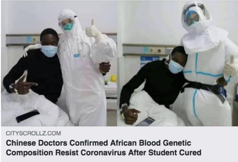
Figure D2. False 1.