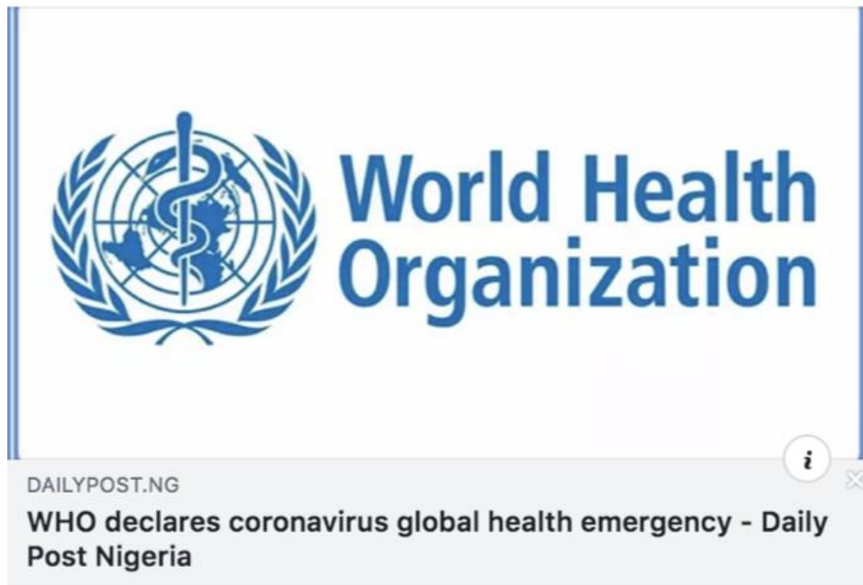
Figure D8. True 2.