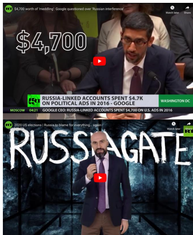
Figure 5. The RT videos shown to participants in our study. The top was used in the April 2020 survey and the bottom in the July. Click each to view.