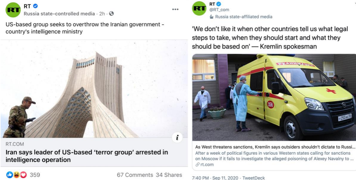
Figure 2. Different implementations of state-media labeling on Facebook (left) and Twitter (right).

It is clear that efforts by social media platforms to increase transparency through these labels can be an effective way to increase user knowledge and combat foreign election misinformation. Platforms should not only expand the use of these identification labels, but also increase transparency more broadly when it comes to pages producing misinformation. An informed user is a resilient user. However, when placing a label, platforms must consider its subtlety relative to the interface if they wish for the label to be effective. Facebook's and Twitter's state-media labels, for instance, may face difficulty in being noticed in that their small placement and light grey color makes them blend with the page background. However, unlike YouTube's label, both Facebook and Twitter have placed their labels above the content (see Figure 2) where it may be more readily noticed by users as they scroll. Further research is needed to confirm the efficacy of their labels.