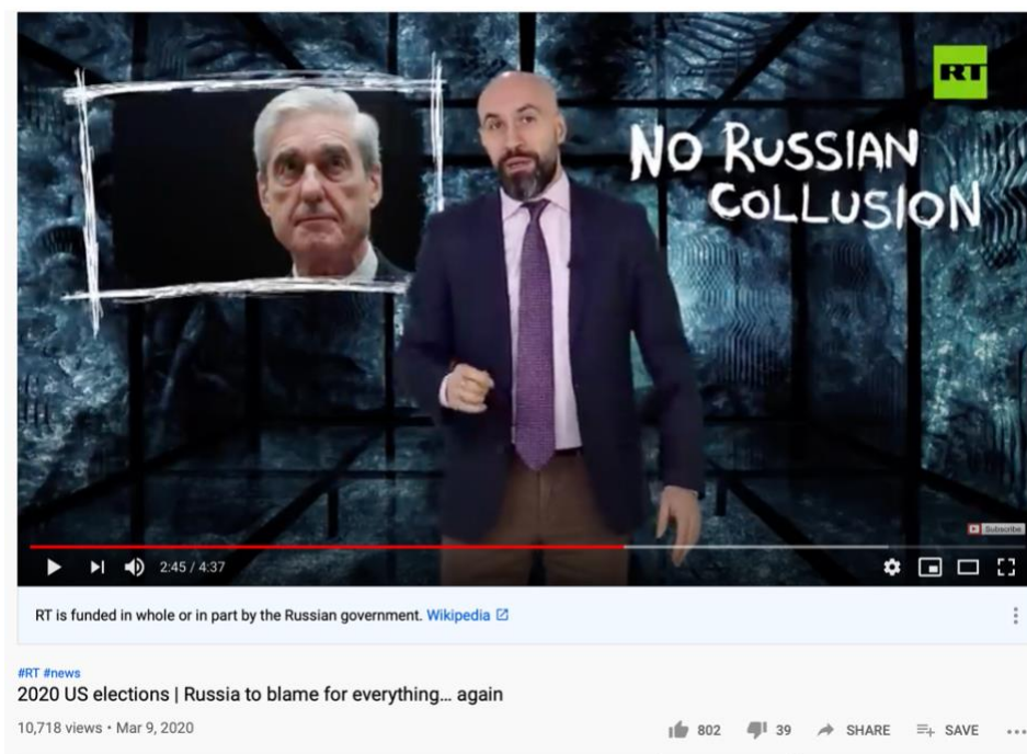
Figure 1. An RT video used in our study with the warning label visible.

Recent work in correcting misinformation has proven fact-checking can work even in political contexts where opinions are deeply tied to identity (Nyhan et al., 2019). However, this success does not necessarily carry over to the concept of funding labels. The YouTube labels state “[X outlet] is funded in whole or in part by [X] government.” No comment is made directly on the veracity of the information in the video, requiring any labeling effect to be based on viewers’ preconceptions about state-funding for news outlets and the state that is funding it. It therefore functions more in the form of a warning label, aiming to mitigate the impact of exposure to misinformation by affecting trust in the outlet. Warning labels and media literacy interventions have been found to affect perceptions of information accuracy and credibility (Clayton et al., 2019; Hameleers, 2020; Tully et al., 2019). However, these studies generally focused on “media literacy” messages which sought to warn users on the dangers of misinformation broadly. By addressing the ownership behind the outlets, the labels additionally stray into the area of source effects where persuasion is dependent on the credibility of the one attempting to persuade (Druckman, 2001).